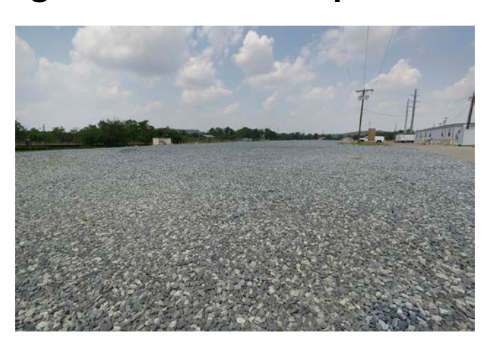
Benning site after demolition completed (looking north from near Benning Road)